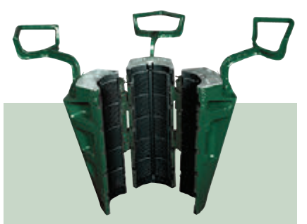
FASTR <sup>®</sup> 1000 Ton Slips Optimum angle and length for better load distribution