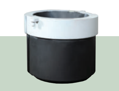
Split Insert Bowl Uniquely designed to accommodate the FASTR <sup>®</sup> Slips