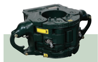
Hydraulic 1000 Ton Elevator Dressed with specially designed inserts for handling the 6 <sup>5</sup>/<sub>8</sub>" Slip-Proof<sup>®</sup> Landing String

The FASTR <sup>®</sup> Landing String System consists of 6 <sup>5</sup>/<sub>8</sub>" FH Slip-Proof<sup>®</sup> Landing String design that features a 6ft Slip-Proof<sup>®</sup> section which prevents the crushing of the tubular by the FASTR <sup>®</sup> Slip System. The V-150 grade FASTR <sup>®</sup> Landing String is rated to 2.0 MM lbs, with the UD-165 grade rated to 2.5 MM lbs.