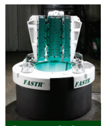
The FASTR <sup>©</sup> Slip System is used for handling loads of up to 1000 ton encountered when landing long strings of casing in deep water operations. The FASTR <sup>©</sup> Landing String System provides safe and reliable operation using standard rig equipment.